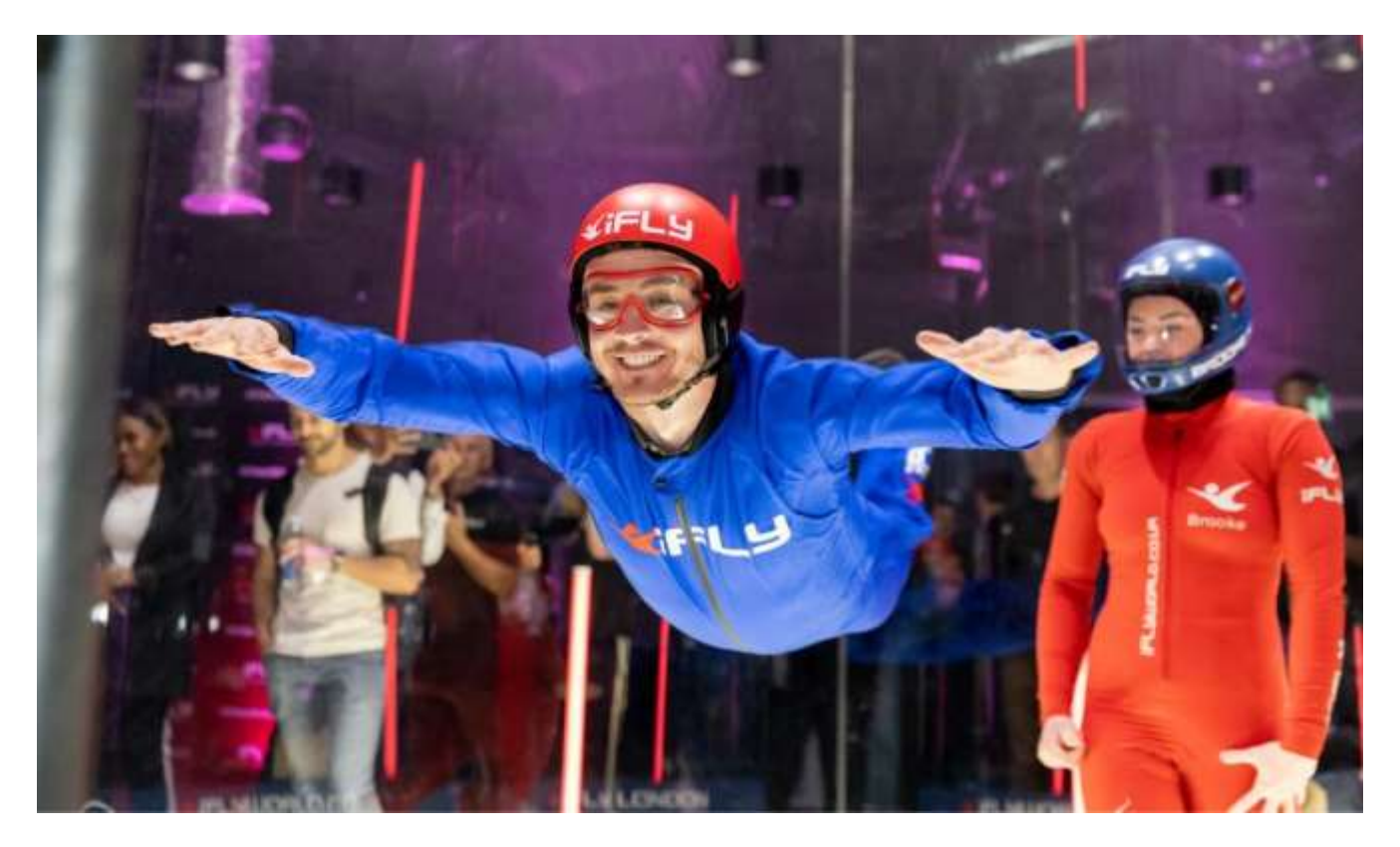
iFLY London at The O2 is where the dream of flight becomes a reality.

An unforgettable sensation of flying awaits you at iFLY London Indoor Skydiving at The O2. Replicating the exact experience of freefall, budding daredevils can experience the joy of human flight without so much as a parachute – and all just 15 minutes from Central London.